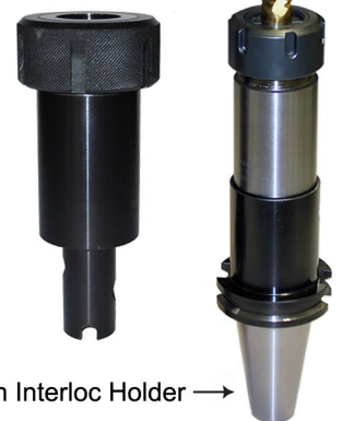
32TG-M200 Connected With Interloc Holder →